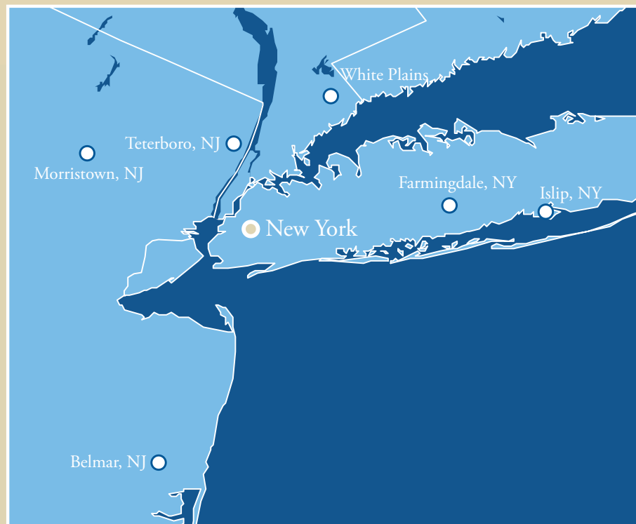
Regional airports near New York City