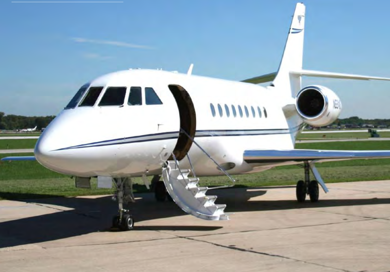
Falcon 2000 - Chicago, IL